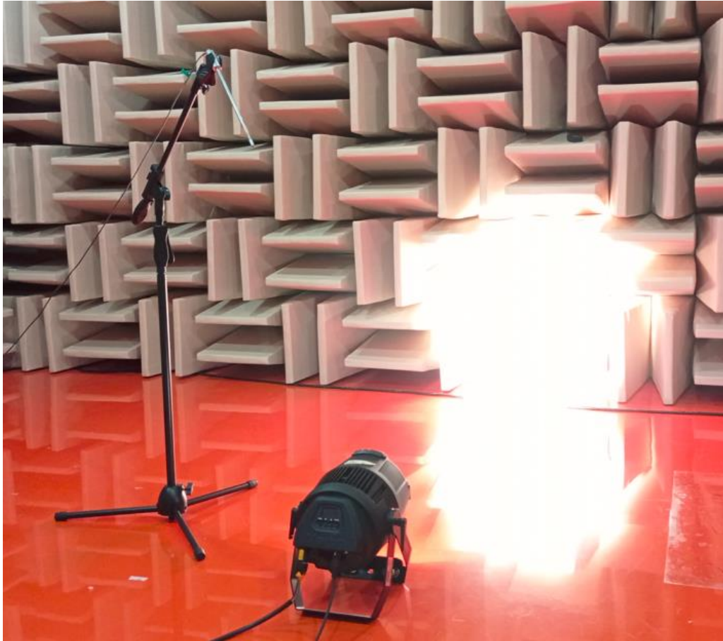
Figure 1: Test setup

The product was placed indoors in a semi-anechoic room in the internal Lab of Harman Technology in Shenzhen, China (See Figure 1). The ceiling and walls were all acoustically absorbent, and the floor was reflective. The main dimensions of the room were 5.9m * 4.9m * 3.3m (length * width * height).